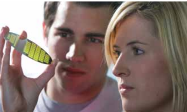
Students studying at the Centre for Infection and Immunity

The Queen's University of Belfast Foundation is a registered charity (number: XR 22432) and is thereby exempt from Income and Inheritance Tax. This means you could reduce the amount of tax you pay on your estate. Gifts of stocks, shares or property can also reduce the tax burden on your estate.