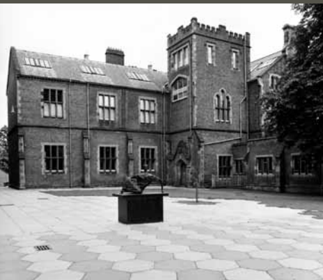
The Administration Building, Queen's University Belfast, 1960s