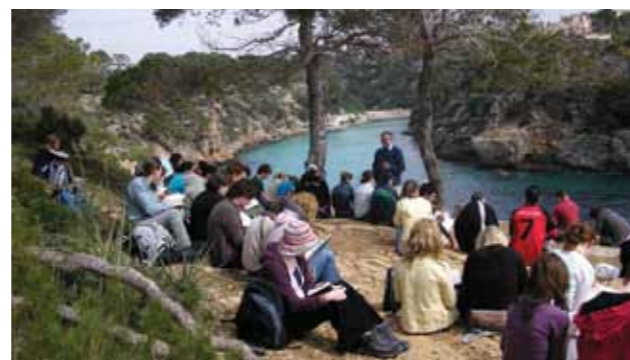
Geography students on fieldwork

£500,000 provides a state-of-the-art lecture theatre.