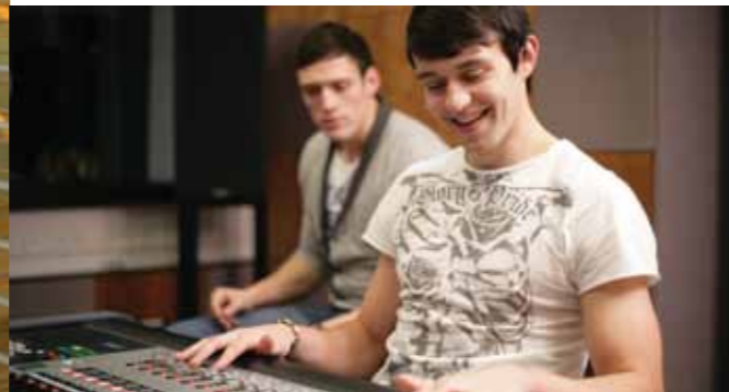
Music teaching, The Harty Room

Would you like to support pioneering research that could produce cures for major life-altering diseases? Do you believe that our economy would benefit from innovative and responsible leadership? Do you recognise the importance of protecting our heritage and developing our cultural offering for the global stage? Would you like to offer future generations of students a financial lifeline?