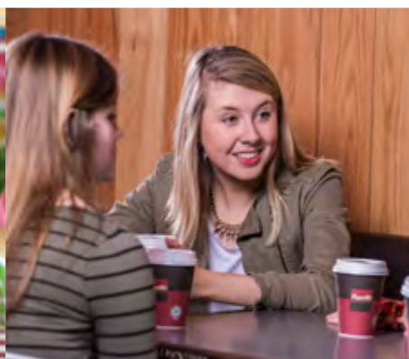
Planning Your Event Page 5