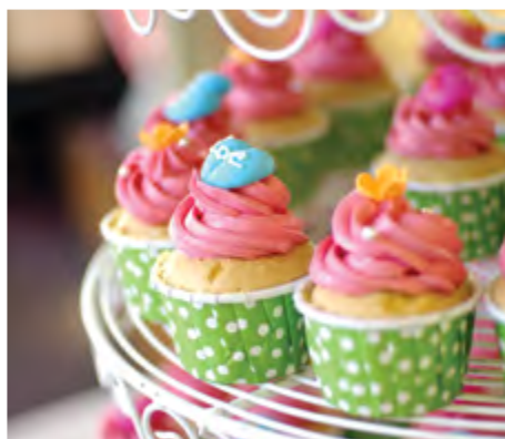
Top Fundraising Tips Page 4