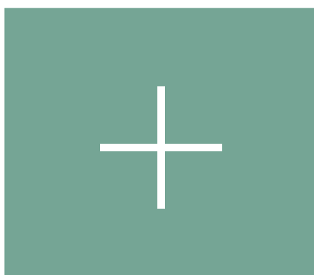
Maximising Your Fundraising Income Page 7