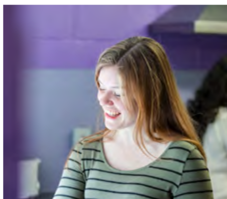
Sending in Money After an Event Page 10